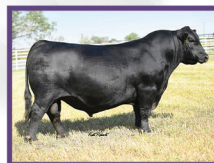
DB ICONIC G95