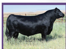
TEHAMA PATRIARCH F028