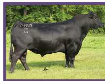
GAR HOME TOWN