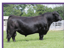
DEER VALLEY GROWTH FUND

PROGENY OF THESE LEADING ANGUS SIRES SELL