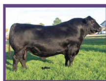
SYDGEN KCF GAVEL 8361